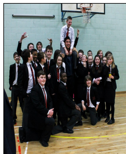
Table Tennis Final