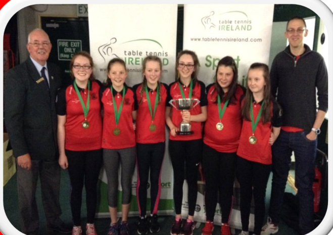
Table Tennis— All Ireland School Champions

Monaghan Collegiate School celebrated Table Tennis success on the 10 th of March in the Lisburn Racket Centre. The under 15 girls won their matches in their category and progressed to the all Ireland finals in Dublin. The under 15 boys came runners up in their category. The under 13 boys came runners up in their category.